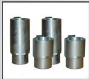
2" and 4" Stackable Adapters