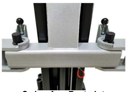
Swing Arm Restraints