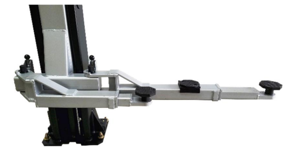
Asymmetric Swing Arm Configuration