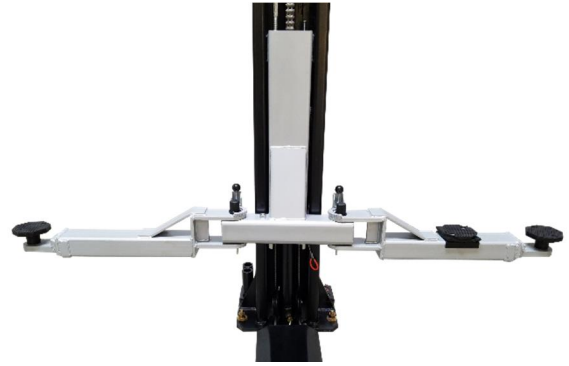
Symmetric Swing Arm Configuration