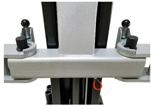
Dual Point Lock Release & Swing Arm Restraints