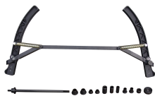
WB-953-ADAPTER-B Motorcycle Adaptor Kit 14mm +