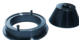
WB-953-LTCS Light Truck Cone Set (36mm)