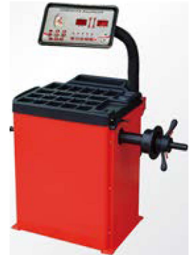
WB-953-B (Sold Without Hood)