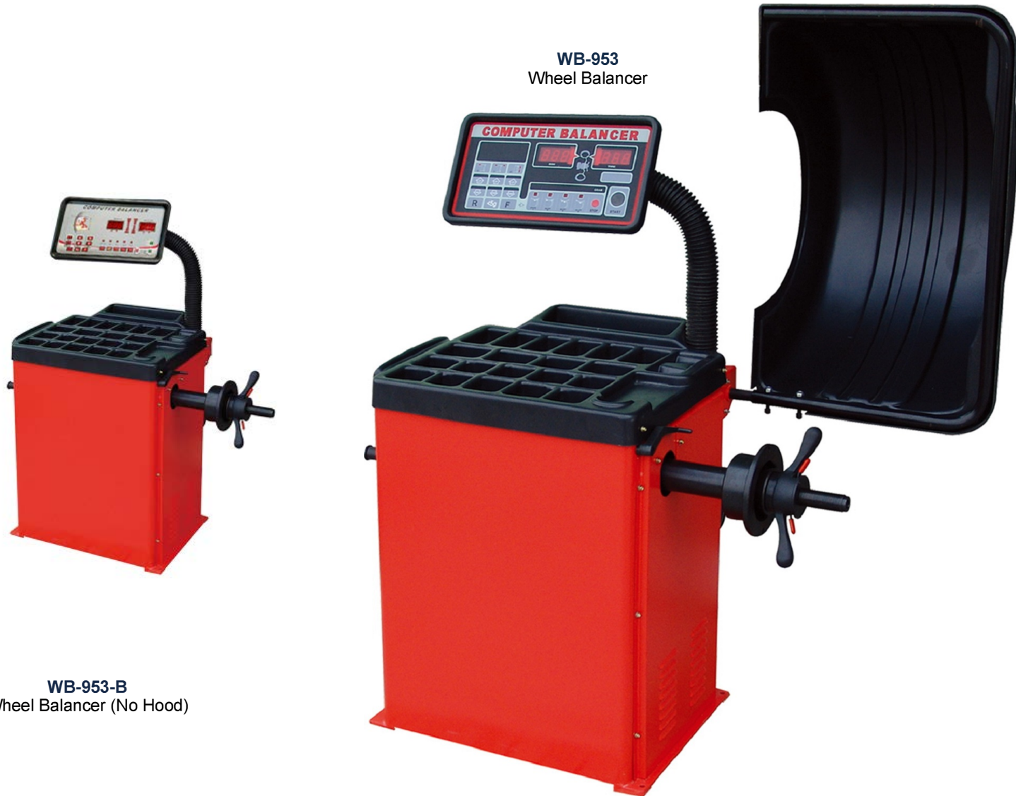
WB-953-B Wheel Balancer (No Hood)

The WB-953 & WB-953-B Wheel Balancers simply provide the best value at the best price!!