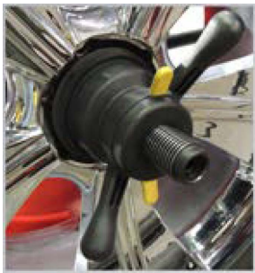
Convenient Speed-Nut Mounting