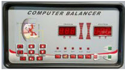
User friendly LED Touch Panel Keypad