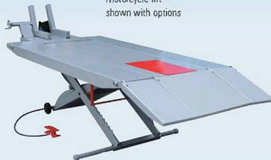
M-1000C Motorcycle lift shown with options