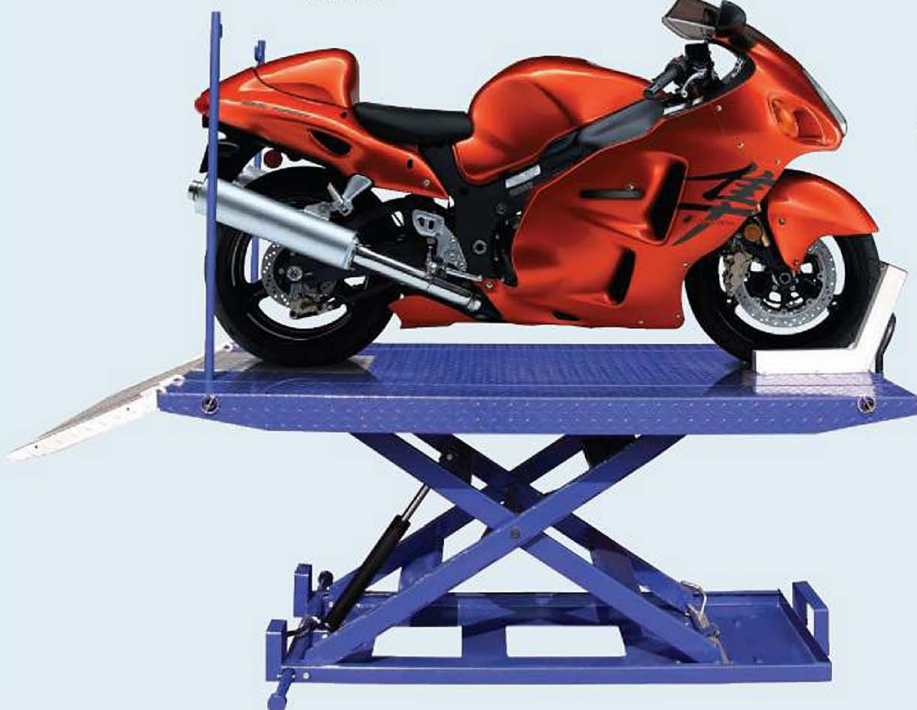
M-1500C-HR Motorcycle lift shown with standard accessories

These lift tables are ideal for making repairs to motorcycles, snowmobiles, ATVs, jet skis, etc. Choose from a range of accessories to customize these tables for your shop.