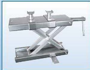
Mini jack Lifting range 3 3/4" to 15 3/4". Spin-up adapters

12" Side extensions (Set of 2) Ideal for four wheelers or extra work space. Expands width of table from 24" to 48". Ramp extensions included.