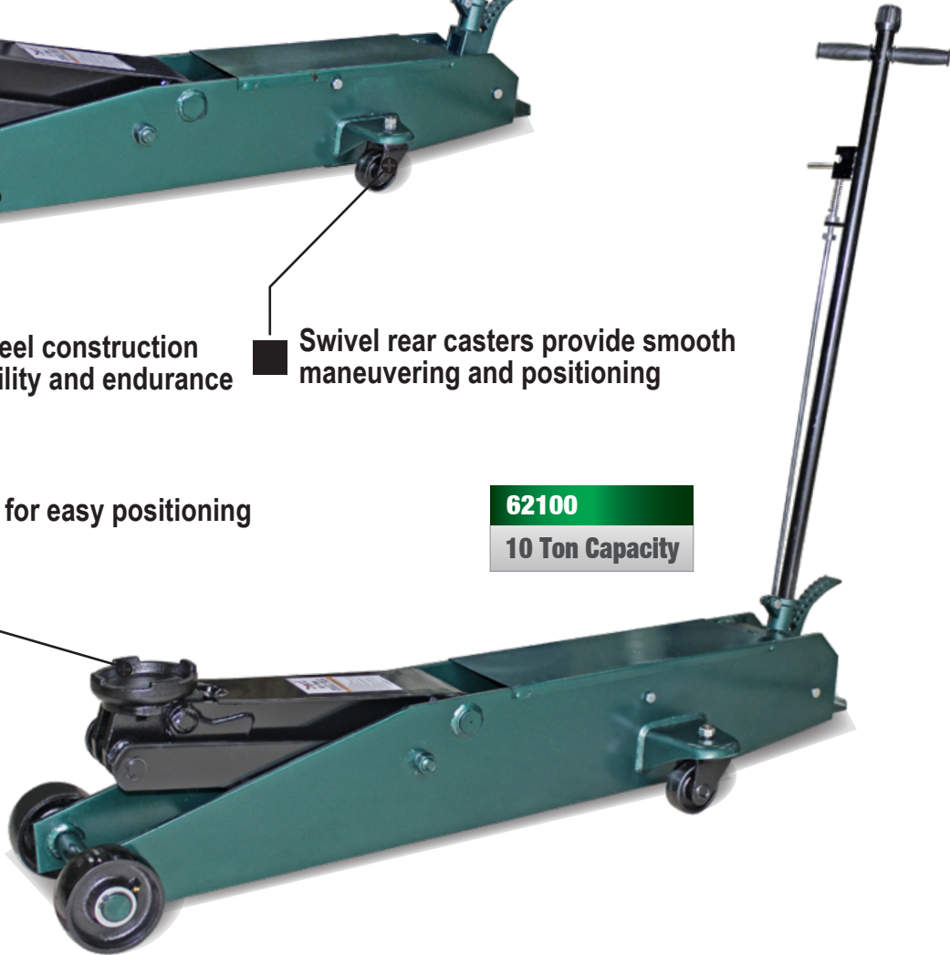
62100 10 Ton Capacity