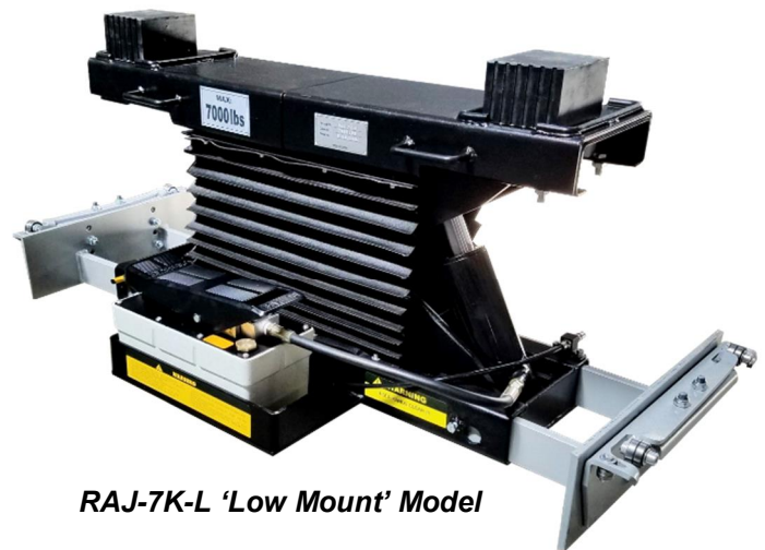
RAJ-7K-L 'Low Mount' Model