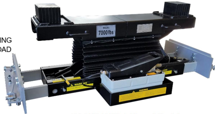
RAJ-7K-H 'High Mount' Model