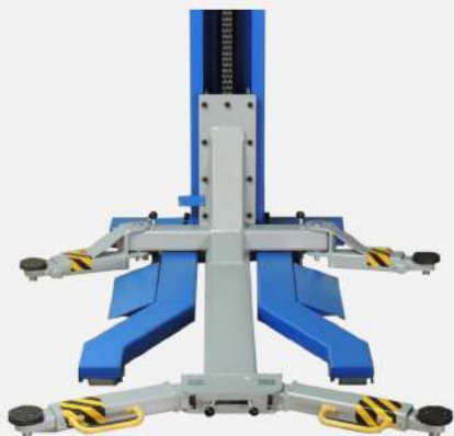
Telescoping Swing Arm Design

Under 4" New Improved Low Profile Design