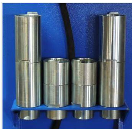
Stack Adapters Included