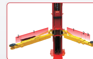
Super symmetric arms designed with three-stage front arms and two-stage rear arms.