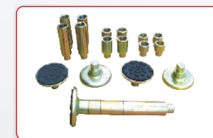
The stackable rubber pads package with 1.5", 2.5", 5" extension adapters.