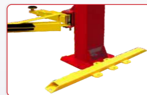
Optional base plate, Kit No. 20903

Two locks, one release. Only available from AMGO.