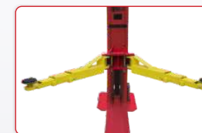
4 three-stage arms are suitable for more vehicles.