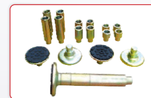
The stackable rubber pads package with 1.5", 2.5", 5" extension adapters.