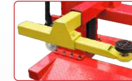
Adjustable arms with two stage positions.