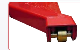
Wheels allow the lift to be rolled into different positions