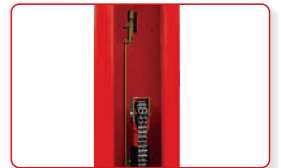
The chain protection cover prevents the chain from slipping off.