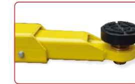
Features insert and screw rubber pads.