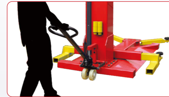
"Pallet jack" style device allows the lift to be moved wherever you need it.