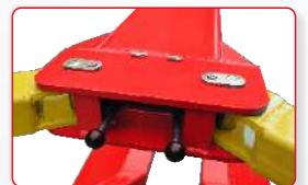
Arm locking device with easy release handles.