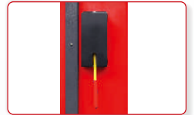
A manual locking safety release device controls the double locks.