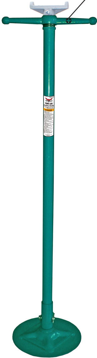
63007 1500Lbs Capacity

■ Height Adjustment Spin Handle that Provides Easy Adjustment to Work Height.