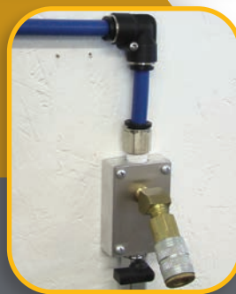
Surface Mount Air line is mounted to wall

Outlets have multiple ports and can be assembled and mounted in a variety of ways