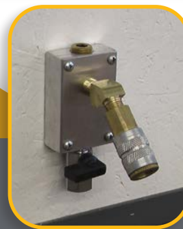
Hidden Mount Air line is inside wall