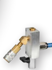
90100 Outlet Kit AIR Chucks not included

Enhance your Master Kit with these RapidAir accessories: