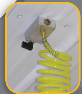
Ceiling Mount Air outlet is mounted on ceiling