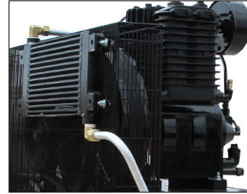
Air cooled after cooler Platinum unit