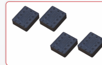
Rubber Lift Pads 1 1/2" height.