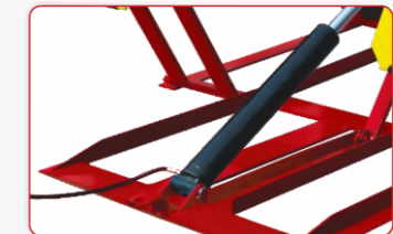
Multiple safety locks with mechanical release.