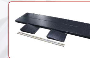
Optional Width Extension Kit Adds an extra width of 23 5/8" (600mm) on the platform to be suitable for three or four-wheel motorcycles. Kit No.: MC001