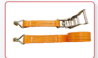
Vehicle Securing Belt Tightens the vehicle before lifting. Ships standard. Kit No.: 720014