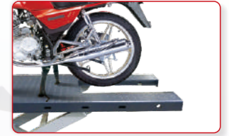
Rear Tire Removal Cover Removable platform cover plate is convenient for rear wheel changing.