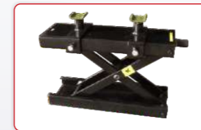
Optional Lifting Jack Lifting capacity: 1,100 lbs (500kg). Perfect for wheel removal. Kit No.: MC005