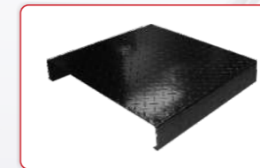
Optional Length Extension Kit Adds an extra 15 3/4" (400mm) length on the platform for the long axle vehicle. Kit No.: MC002