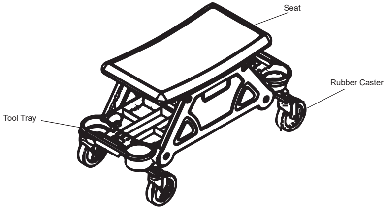
Figure 1 - Model C-9300 Components

⚠ WARNING: Do not use this device for any purpose other than that for which it is expressly intended.