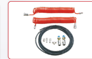
• Optional airline kit. Easy and convenient installation with all models of rolling jacks with a pneumatic pump.