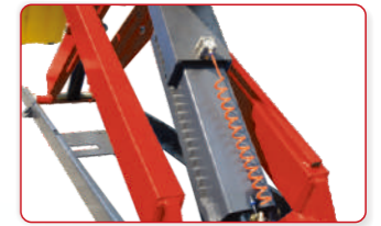
• Mechanical lock and air-driven safety release.