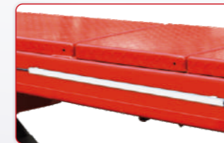
• Optional LED lights provide extra and efficient lighting for underneath the vehicle.