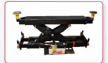
• Optional Rolling Jacks