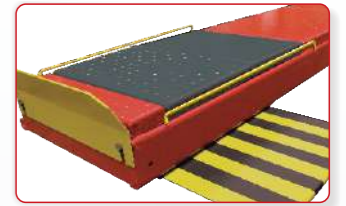
• Pull-out shelf for extra room during service.